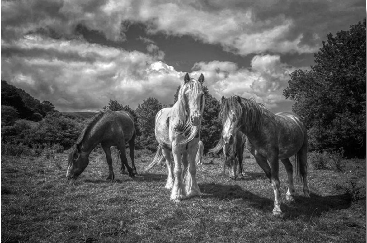
Rescued Mountain Ponies by Annie Blick : Winner, Monochrome Week.