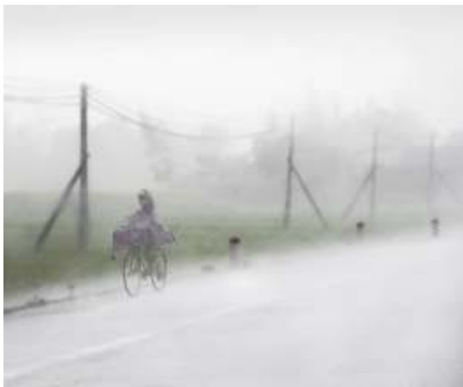
Monsoon